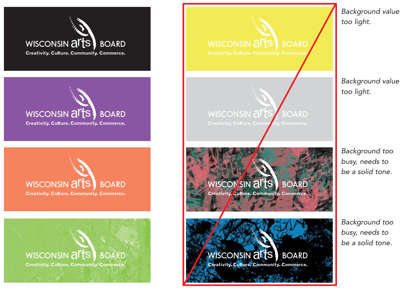
figure 2: improper reverse usage

Note: The green example above shows the use of texture, but overall the background has a solid tone feel, not a busy or disruptive feel.