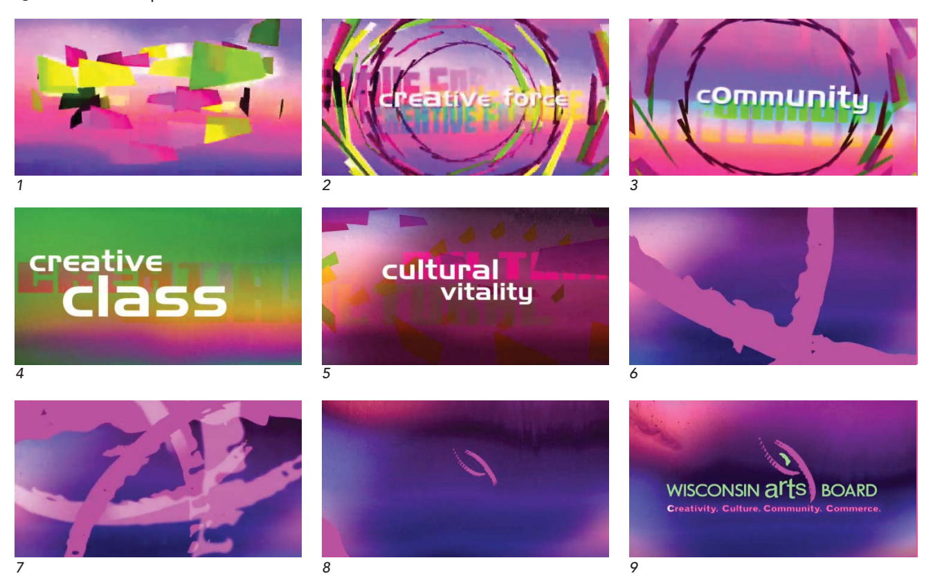
figure 2: video sample

NOTE: The logo elements begin to appear on screen and build to reveal the logo, it is shown in its entirety at the end. See section 3.4, Individual Logo Elements.