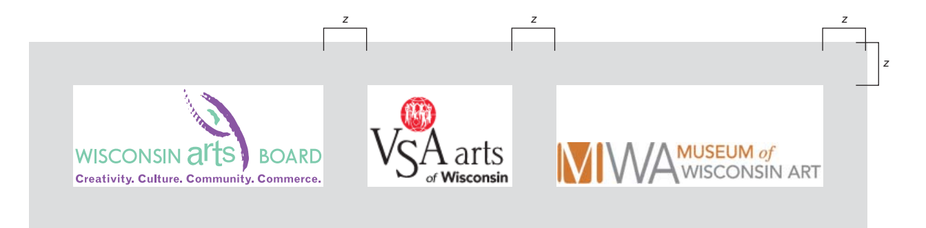
figure 1: multiple logo use

When using the WAB logo in conjunction with other logos, use best judgement in positioning logos together. Try to maintain an area of isolation around each logo, figure 1 .